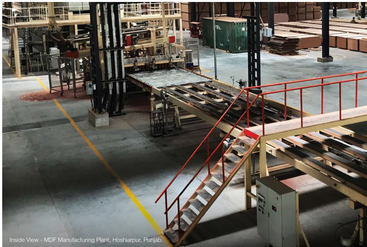
Inside View - MDF Manufacturing Plant, Hoshiarpur, Punjab.