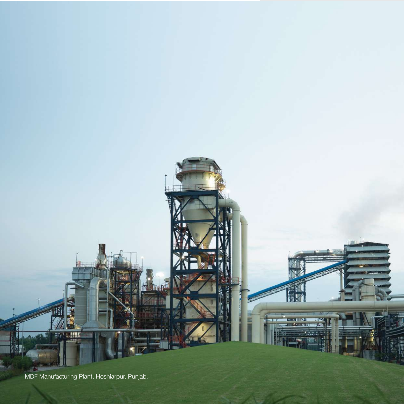
MDF Manufacturing Plant, Hoshiarpur, Punjab.