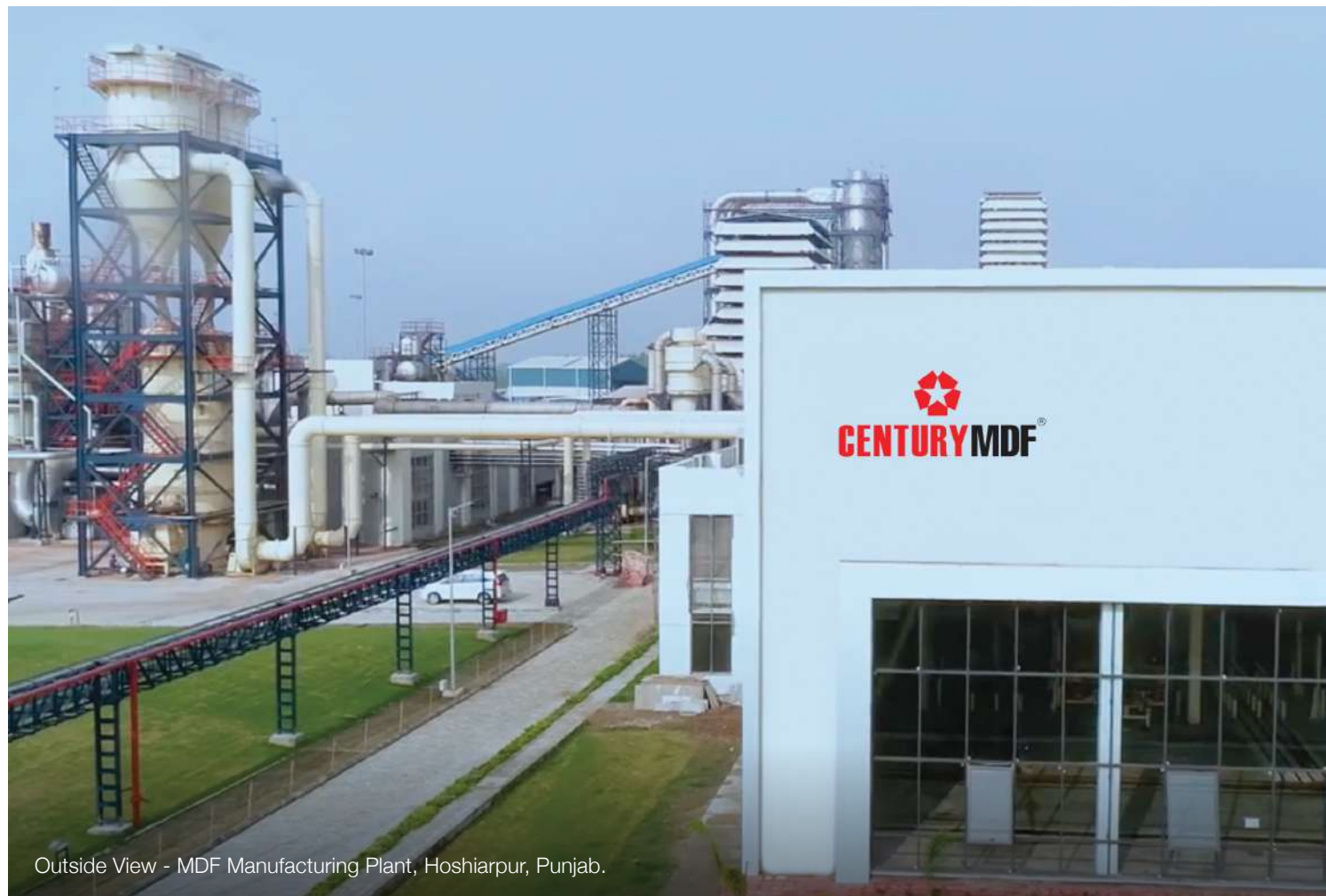
Outside View - MDF Manufacturing Plant, Hoshiarpur, Punjab.